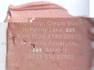
From top, Cream Blush in Penny Lane, £21, Nars (020 8740 2085), and Jelly Aquarista, £69, Astalift (0333 010 0200)