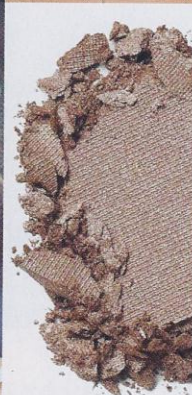
Eye Shadow in Grace, £13, Stila (0800 123 400)