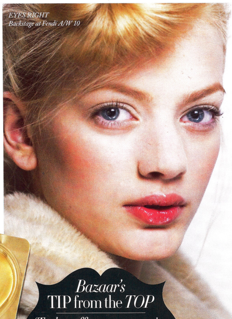
EYES RIGHT Backstage at Fendi A/W 10