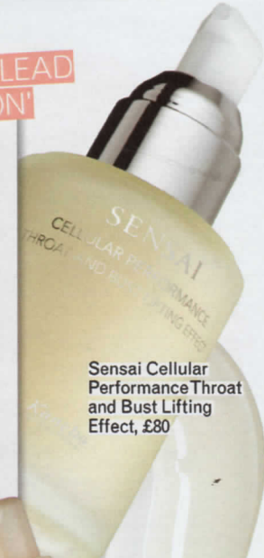
Sensai Cellular Performance Throat and Bust Lifting Effect, £80