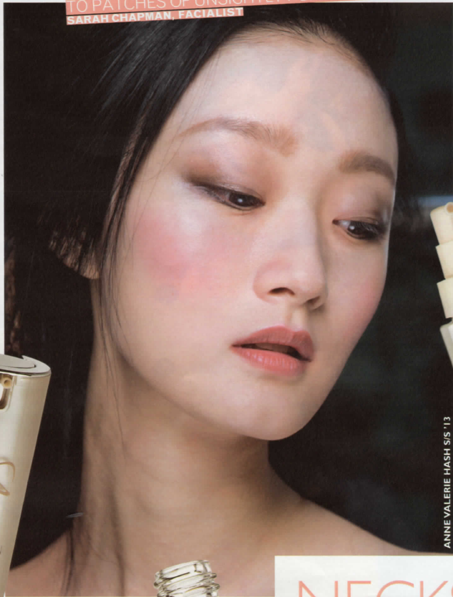
ANNE VALERIE HASH S/S '13