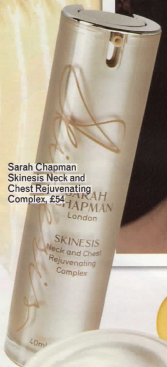
Sarah Chapman Skinesis Neck and Chest Rejuvenating Complex, £54