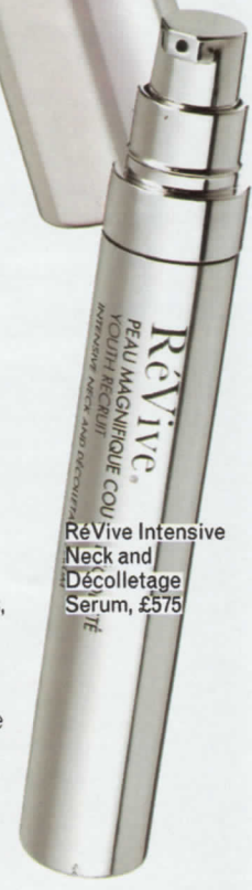
RéVive Intensive Neck and Décolletage Serum, £575