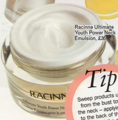
Racinne Ultimate Youth Power Neck Emulsion, £36