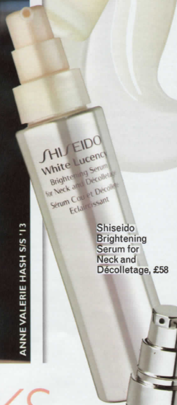
Shiseido Brightening Serum for Neck and Décolletage, £58