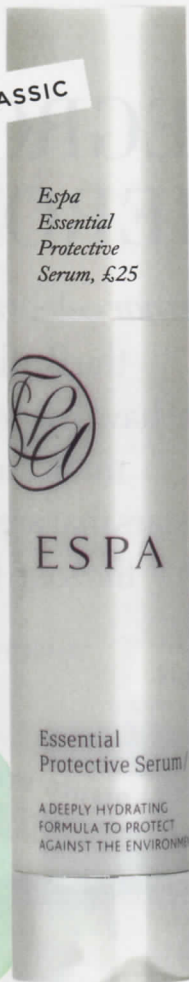
Espa Essential Protective Serum, £25