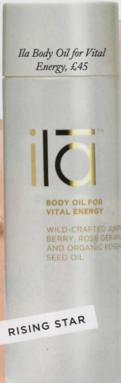
Ila Body Oil for Vital Energy, £45