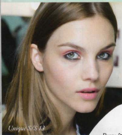
Unique S/S 13