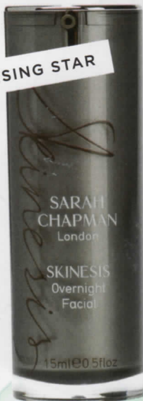
Sarah Chapman Skinesis Overnight Facial, £45 for 15ml