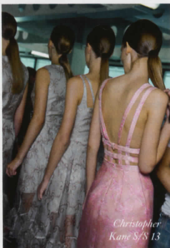
Christopher Kane S/S 13

With its energising body oil and exfoliating scrubs made from locally sourced Cotswolds ingredients, Ila is making its mark on the natural-beauty industry and putting the focus back on blissful at-home relaxation.