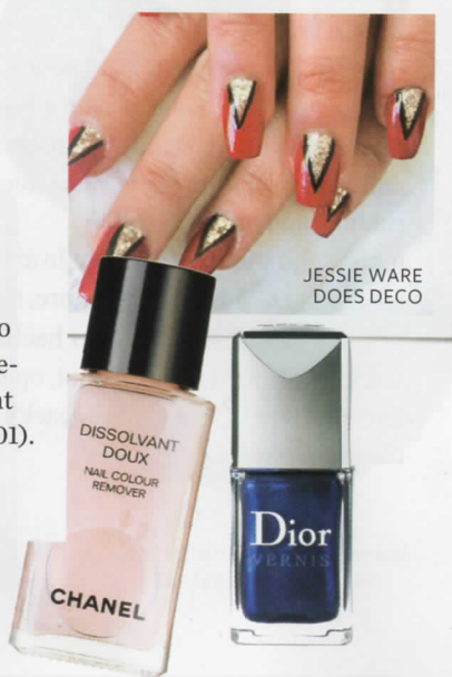
JESSIE WARE DOES DECO

Far right, Vernis in Blue Label, £18, Dior (020 7216 0216); right, Nail Colour Remover, £12, Chanel, as used at the Covent Garden boutique