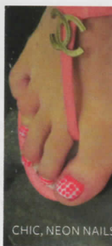
CHIC, NEON NAILS

"I loved working with Taylor Swift for InStyle's April issue; she was so lovely. I painted her nails a peachy-pink, which I also used on Rose Byrne for her recent appearances on the red carpet and The Jonathan Ross Show . How cool are Jessie Ware's art deco