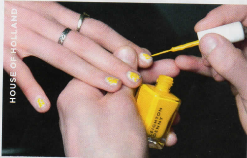
HOUSE OF HOLLAND