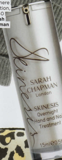
SKINESIS Overnight Hand and Nail Treatment, 15ml @ £0.50 SARAH CHAPMAN London