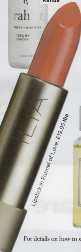
Lipstick in Funnel of Love, £19.95 Illa

FOOTCARE Combine Révérence de Bastien's Natural Horn Nail Buffer and Kure Bazaar Nail Polish in Corso 22 for a luxe pedicure set.