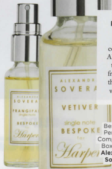
Bespoke Perfume Composition Box, £985 Alexandra Soveral