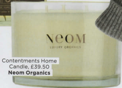
Contentments Home Candle, £39.50 Neom Organics