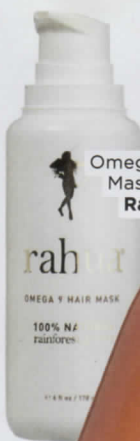
Omega 9 Hair Mask, £52 Rahua