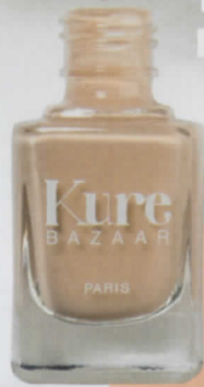
Nail Lacquer in Corso 22, £14.95 Kure Bazaar