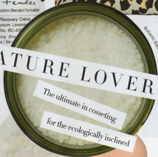
Botanic Bath Salts, £28 Bamford