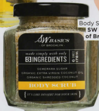
Body Scrub, £22 SW Basics of Brooklyn