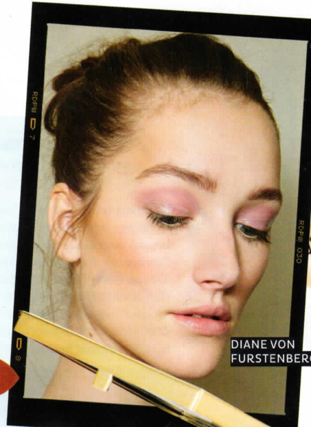
DIANE VON FURSTENBERG

Couture Palette No.9 Love, £39.50, yslbeauty.co.uk